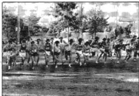
Start of the Under 19 Boys all schools Cross Country Championship conducted in Sydney.